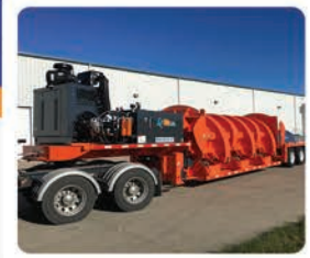
580CL CRANELESS BALER LOGGER