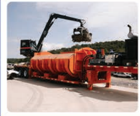
580CL - INDUSTRY LEADING BALER LOGGER