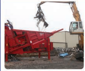
BONFIGLIOLI SQUALO SERIES MOBILE GUILLOTINE SHEAR