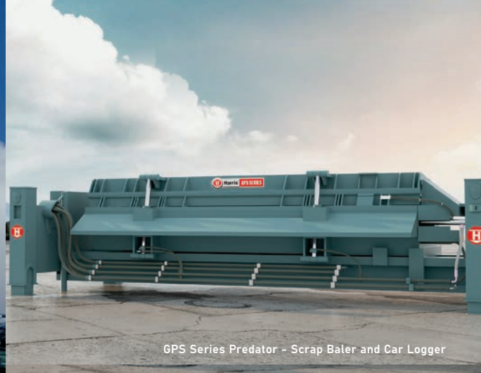
GPS Series Predator - Scrap Baler and Car Logger